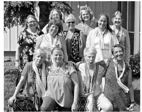
GGG planning team for the 2014 Gitchigaaming Gathering:

When we unite our voices, prayers and songs in Ceremony, we send out very powerful vibrations that make a difference in the world ... initially in a subtle way, but which eventually will become real in the physical world.