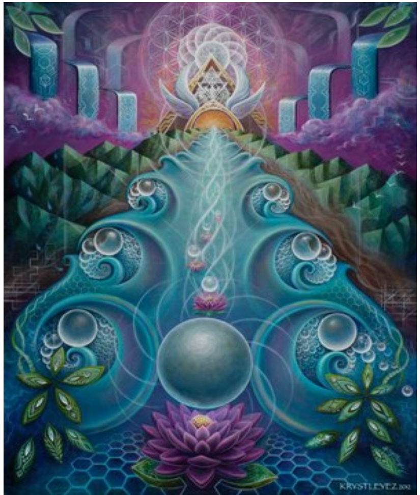
FLOW AS ONE by Kristle Smith

IF WE JOIN GLOBALLY IN NUMBERS LARGE ENOUGH WATER CAN REVEAL ITSELF INTO OUR COLLECTIVE CONSCIOUSNESS ALLOWING THE GREATER COMMUNITY OF