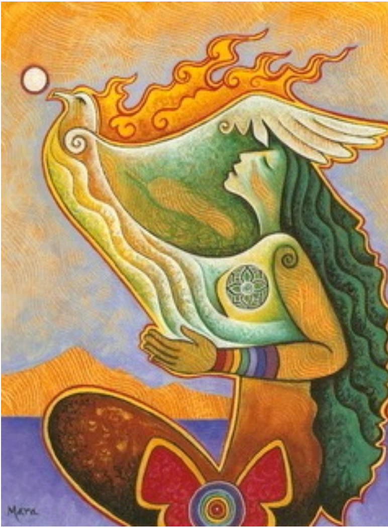
Rooted In Reverence, Seated In Spirit

Walks Tall Woman teaches us how to be proud of our accomplishments through self-esteem, not self-importance. She shows us that the more we refine our skills, the happier we are with ourselves. Actions speak louder than words and when we are living examples of our philosophies, we are Walking Our Personal Truths. When we Walk with Truth, there is no need to fear what others think of us. Reputation is based upon integrity and inner knowing, not on the opinion of others who may be jealous or insecure about themselves.